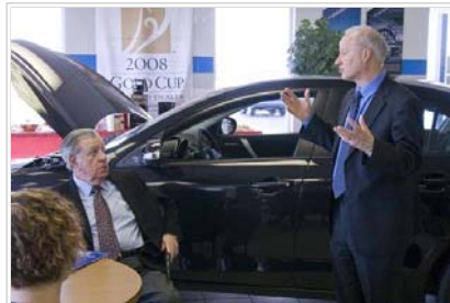
U.S. Rep. Mike Coffman, R-Colo., speaks Wednesday during a town hall meeting at Gateway Mazda on Havana Street.

Coffman said he would oppose any plan that helps the domestic companies at the expense of other companies.