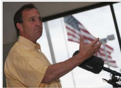
PERLMUTTER IN AURORA U.S. Rep. Ed Perlmutter talks during a discussion of the automotive industry, the economy and other issues on Monday, Aug. 3, at Budget Auto Sales in Aurora.

"Personally, I just think (our current system) is wrong. I think it's a crazy system; I think it's unconstitutional under the 14th Amendment, which insures equal protection to people," Perlmutter said. "I think we have a broken system in that it discriminates against most people."