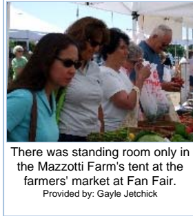
There was standing room only in the Mazzotti Farm's tent at the farmers' market at Fan Fair.

Tuesday, June 24, was opening day for the 2008 Farmers' Market at Fan Fair on Havana Street. A great selection of fresh produce, gourmet salsas, premium Angus beef, breads, specialty hotdogs & popcorn, as well as beautiful African baskets made shopping on Havana Street a real treat. This year's vendors include Dogfather Hotdogs, Tupperware, What's Poppin, Styria Bakery, Snow Creek Ranch Steaks, Mazzotti Farms, McCurry Farms, Colorado Organics, Rocky Mountain Rice Company, Forte Farms, J&Js Gourmet Salsa, and New Era Distributing. The farmers' market sets up every Tuesday from 11 a.m. - 3 p.m. at 3rd and Havana Street, one mile east of Lowry, through mid-October.