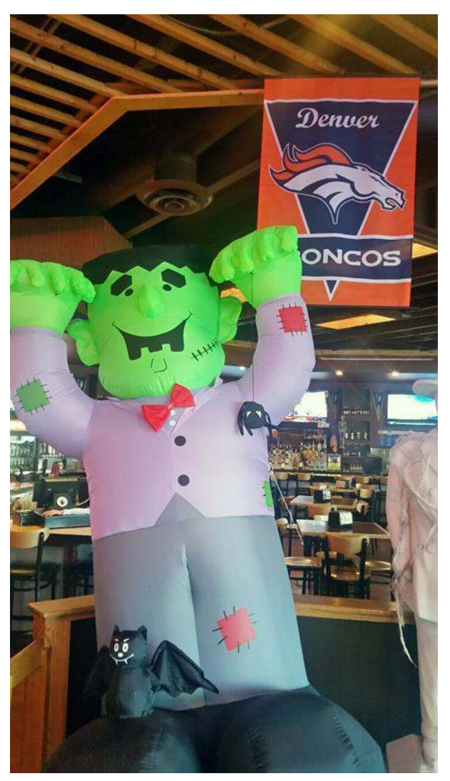
Bronco Fans Join us On Havana Street